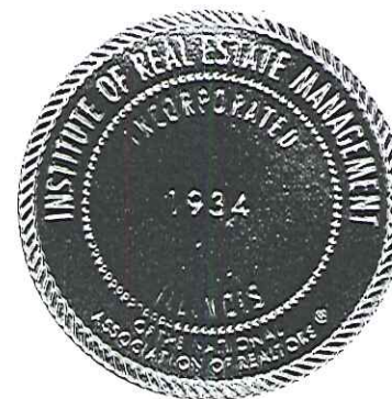
Executive Vice President